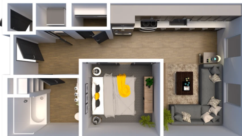
AXEL - STUDIO X 1 BATH: 550 SF