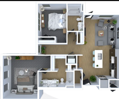
HYGGE - 2 BED X 2 BATH: 1,363 SF