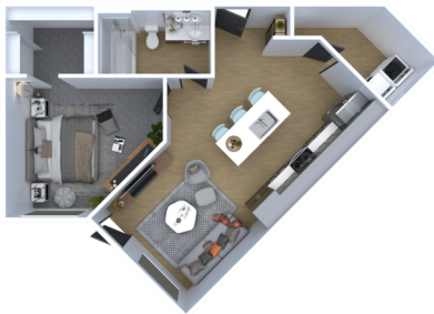
BERGEN - 1 BED X 1 BATH: 661 SF