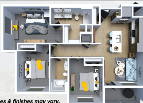
ODIN - 3 BED X 2 BATH: 1,254 SF

*All renderings & square footages are approximations. Floor plan sizes & finishes may vary.