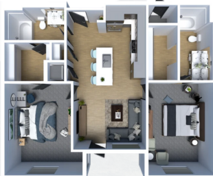
SELMA - 2 BED X 2 BATH: 1,099 SF