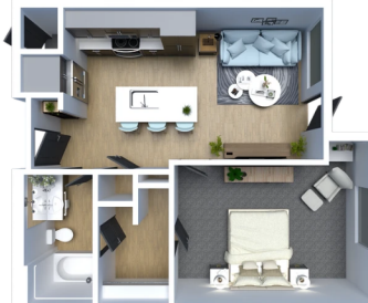
FREJA - 1 BED X 1 BATH: 718 SF